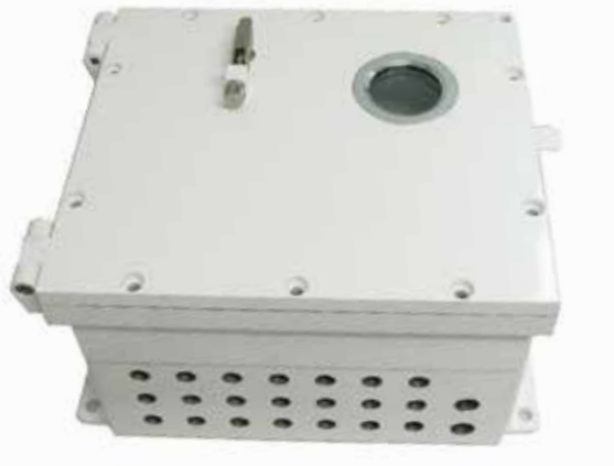
LARGE FLAMEPROOF ENCLOSURE